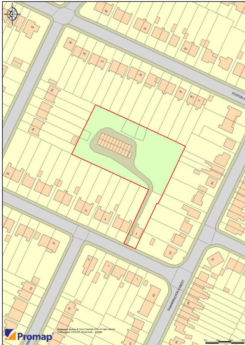
Figure 2 Site Plan (Application site outlined in red).